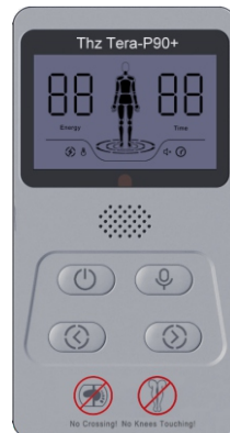
Main Control Panel